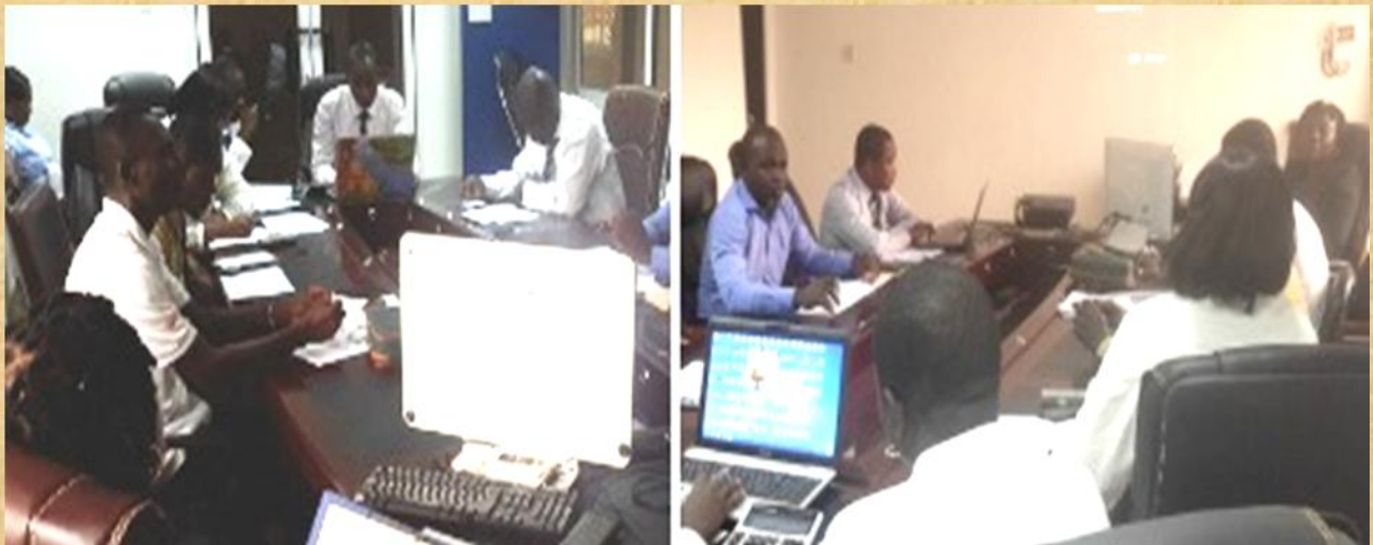
CRAN MF management seated at the meeting:

On the 11th of January 2016, CRAN MF had a budgetary meeting to draft their budget for 2016. The budget is expected to generate higher incomes through provisions made for entering into new markets by diversifying products and maintaining quality client base. Provisions has been made in the budget to improve logistics such as purchase of new vehicles and motorbikes for CRAN MF units and field officers. There is provisions for continues training on proper loan assessment for loan officers among other training and skill development to enable staff and management collectively achieve CRAN MF'S targets for 2016.