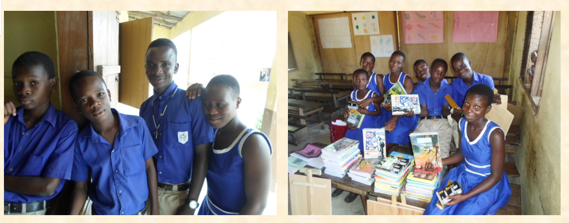
Some of the children in the School. The future of these children look bright as they have the opportunity to attend school. If the school had not come, perhaps, it would have been a different story.