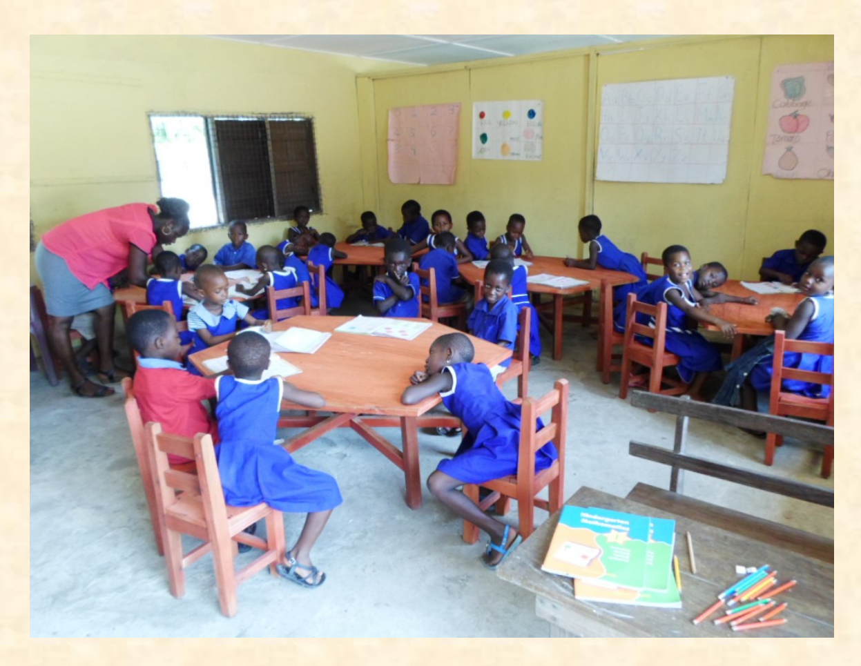
The KG children sitting on their chairs round the tables which were donated by the GES

The Ghana Education Service (GES) has supplied six round large tables and thirtyone single chairs for each of the thirty-one children in the KG 1 class. The nice tables and chairs have come to replace the old ones which have become quite difficult to us. This is the first batch of set of tables and chairs to be supplied to the KG children of the Abakam School. The second set of tables and chairs will be supplied to the KG 2 class which has the same enrolment as the KG 1. Both the teachers and pupils of the class are very delighted for the kind gesture and grateful to the GES for thinking about the school. The School is very grateful to the GES for recognizing the School and supplying the nice furniture. It is hoped that this will motivate the children to come to school regularly and take their studies seriously.