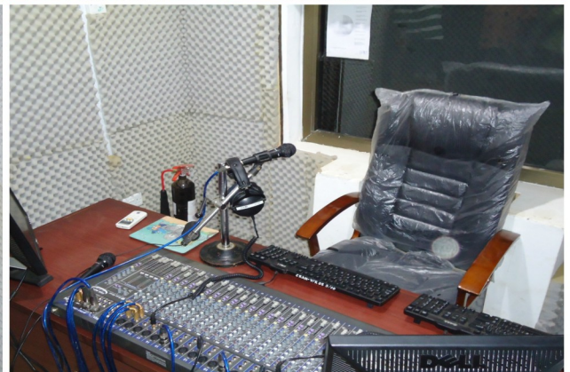
Outside and inside view of Heritage FM