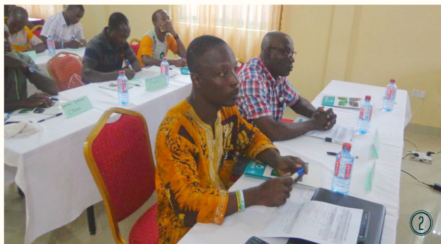
Some facilitators and participants at work during the CARI business skills training.