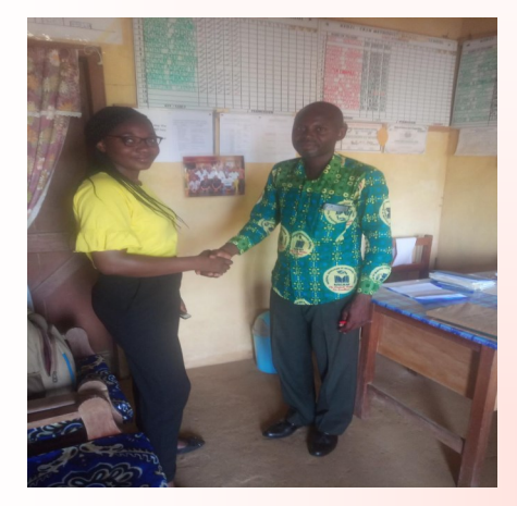
Pictures of Programme Officer, some of the teachers and pupils of some of the schools vis-