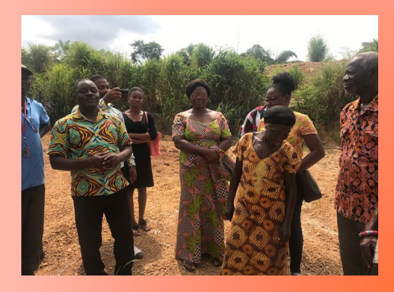
A section of community members and staff of CRAN at the commissioning.