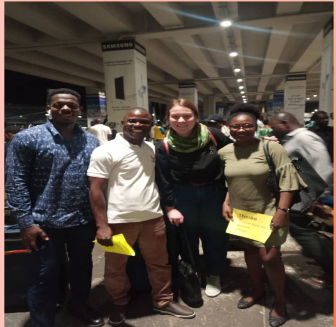
Theske being welcomed by CRAN Staff at the Kotoka International Airport, Accra