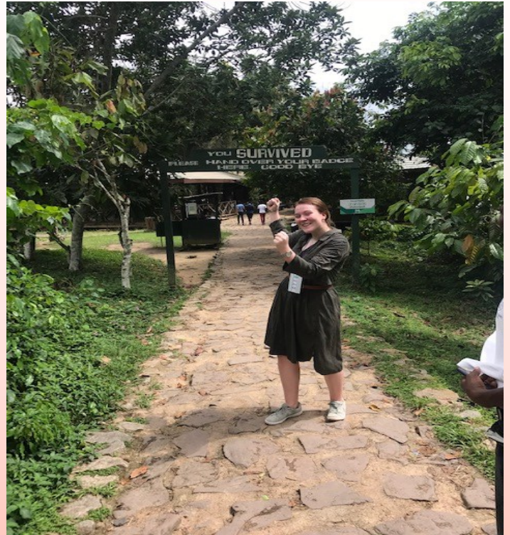
Theske on the canopy walk at Kakum National Park