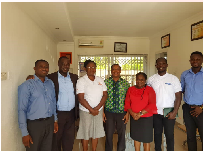
Staff of BoG and CRAN Microfinance in a photo after their meeting .

After the sanitization exercise in the financial sector in June, 2019, the Central Bank of Ghana (BoG) is not relenting in its' efforts to ensure the financial sector is sound. As such, there was a follow-up visit to CRAN Microfinance to conduct an on-site examination. The exercise took three (3) days and Management was debriefed on ways to improve the business. On-site examination is the Central Bank's routine service to the financial sector and the visit was the second for CRAN Microfinance this year.