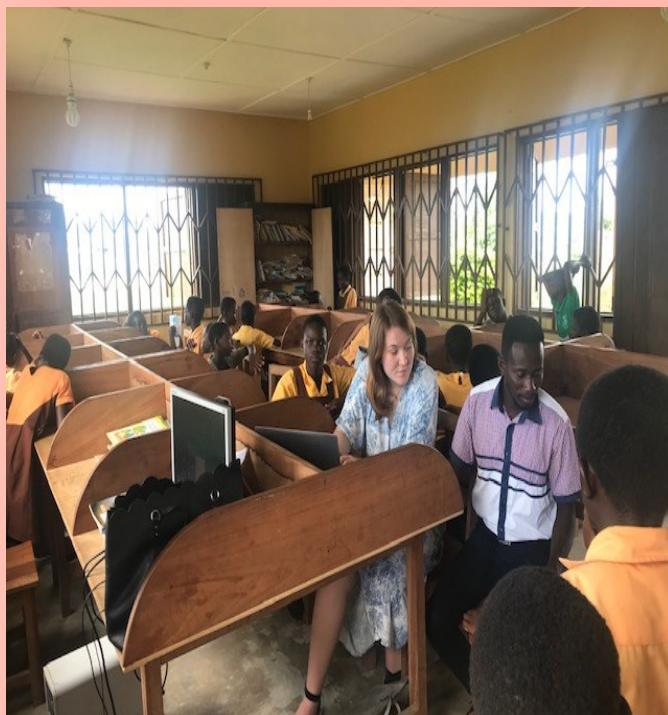
Theske with a teacher taking profiles of some new CESS children