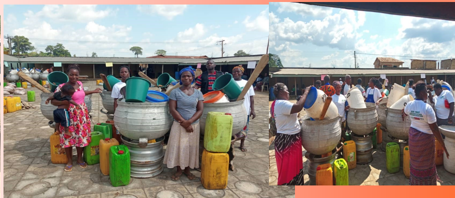
Trainees & equipment distributed to them