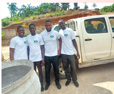
Staff & Trainers of CRAN

CRAN partnered with Friends of the Nation, a sister Non– Governmental Organization (NGO) in the Western Region of Ghana to conduct a training for about one hundred and thirty (130) participants in identified communities in the Western Region . The training was on bee keeping and local black soap making. After which equipment for soap making and beekeeping were distributed to the participants. We are hopeful the participants would take up the lessons learnt and become self employable and financially self sufficient.