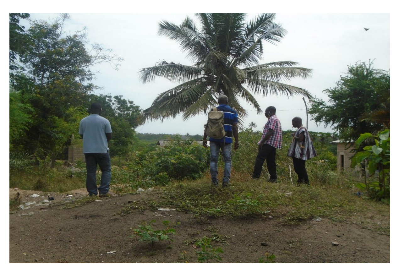
First Picture of the site allocated for the construction of the Toilet Facility