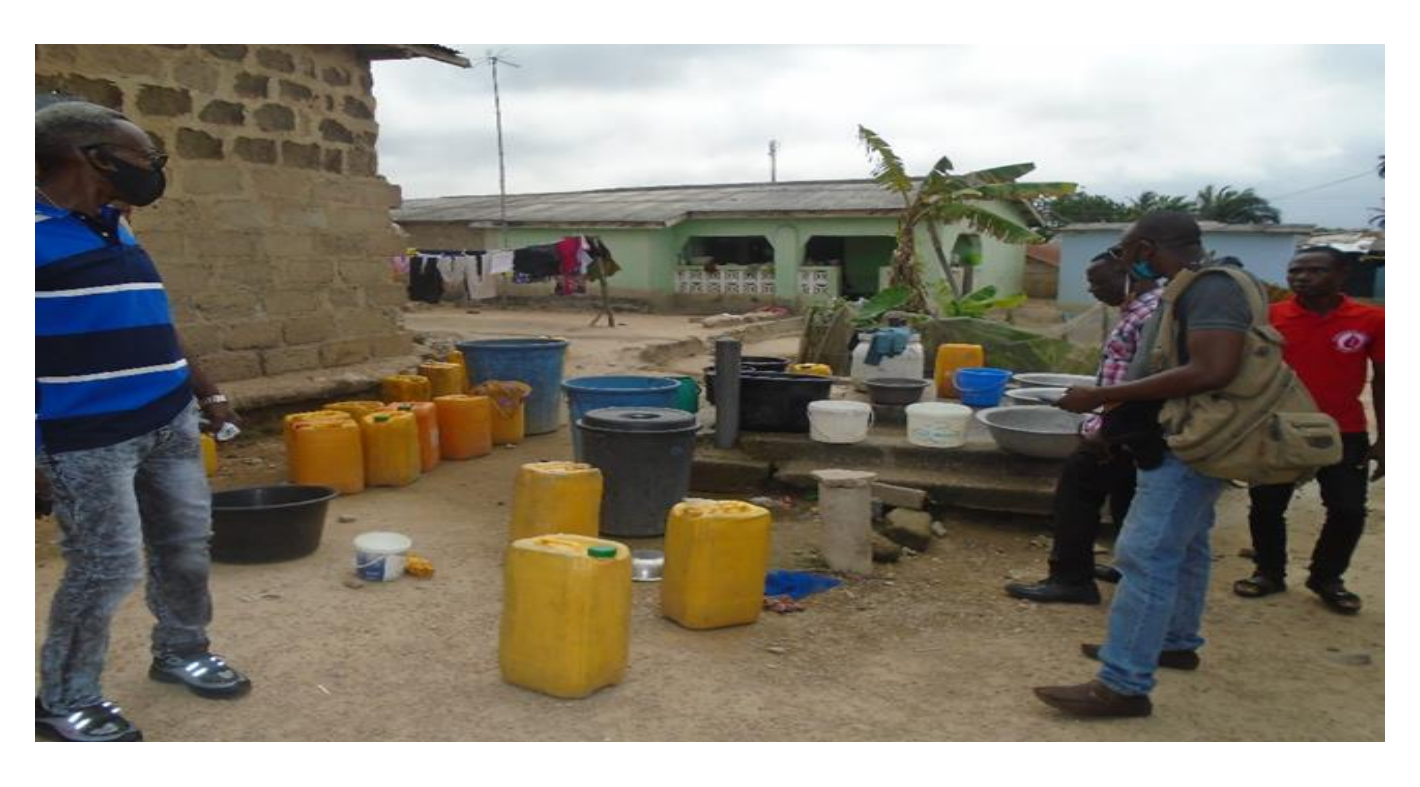
A queue gallon at Essuekyir for water