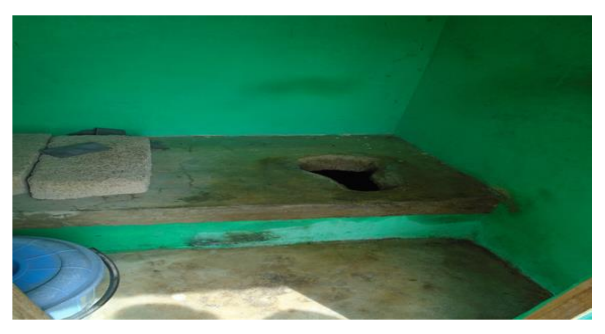
An Inside Picture of the toilet facility in Essuekyir