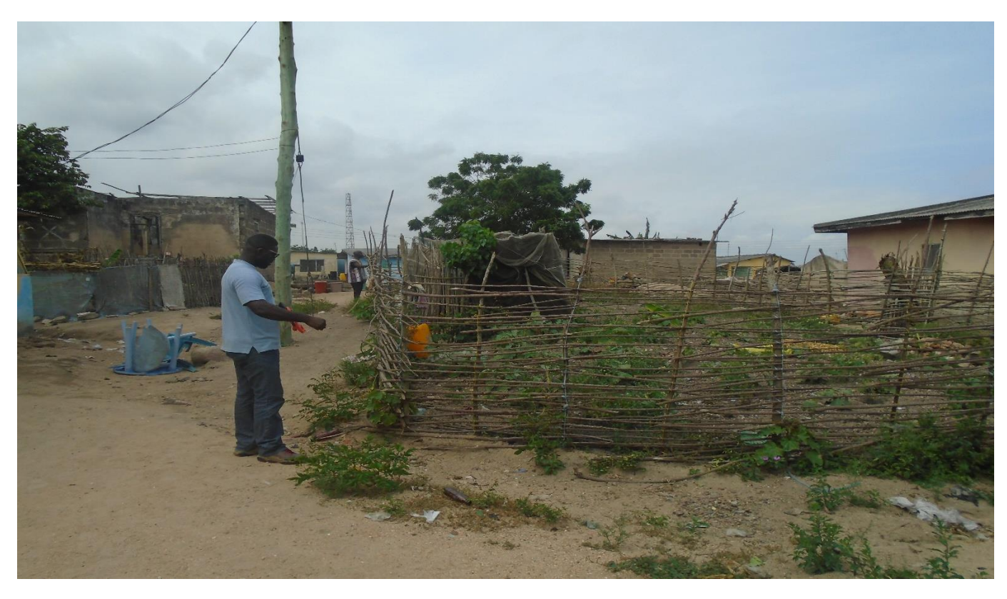
A second picture of different allocated land for the construction of the facility