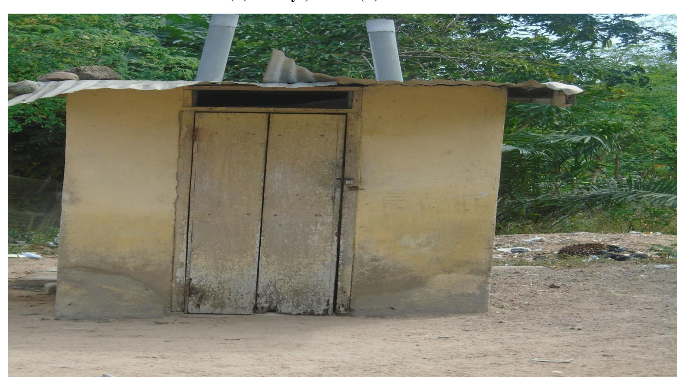
A picture of a toilet facility in Essuekyir