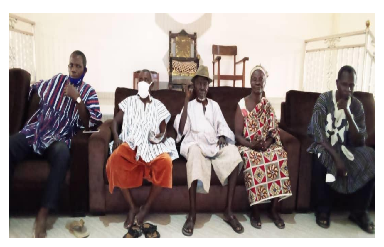
A picture of the chief and his elders from second (Left ) is the chief