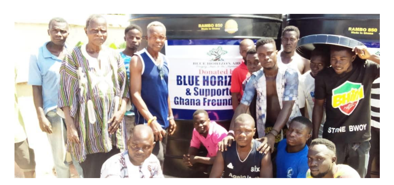
A picture with the youth that helped offload the Water Storage Facility