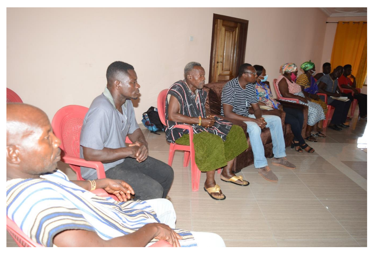
A picture of a few community members present at the meeting during the presentation