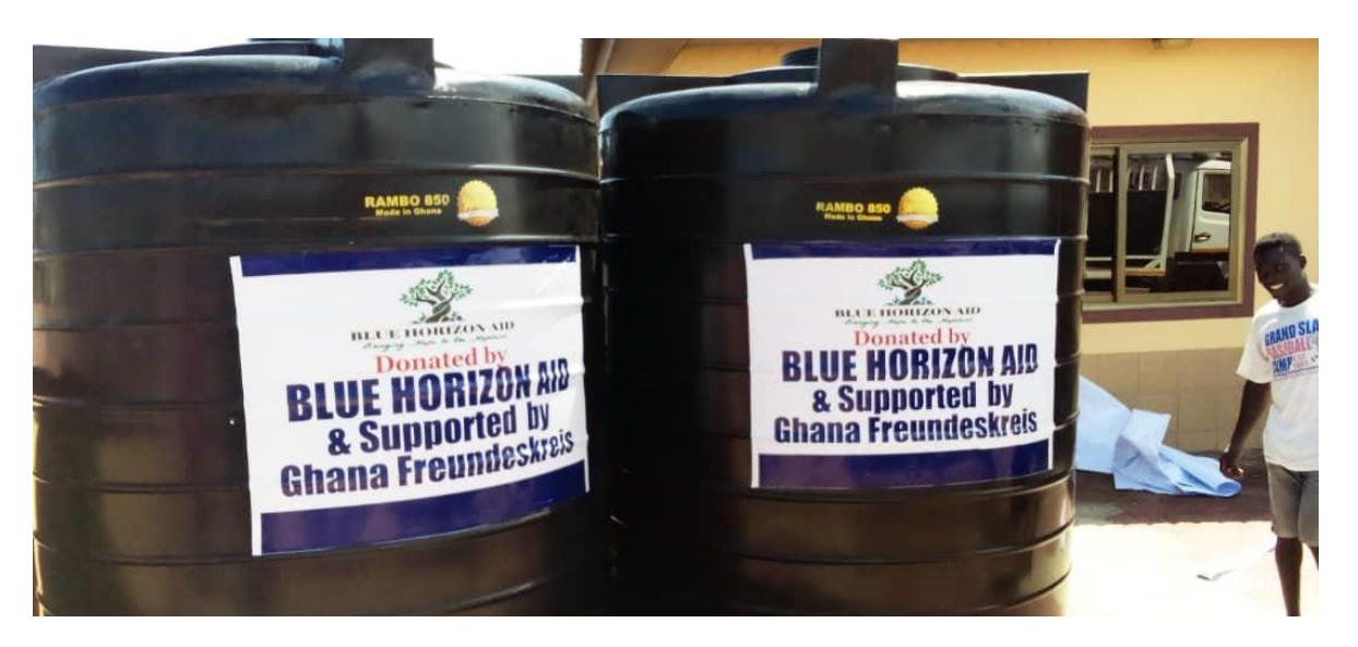
A Picture of the Water Storage ( Polytank)