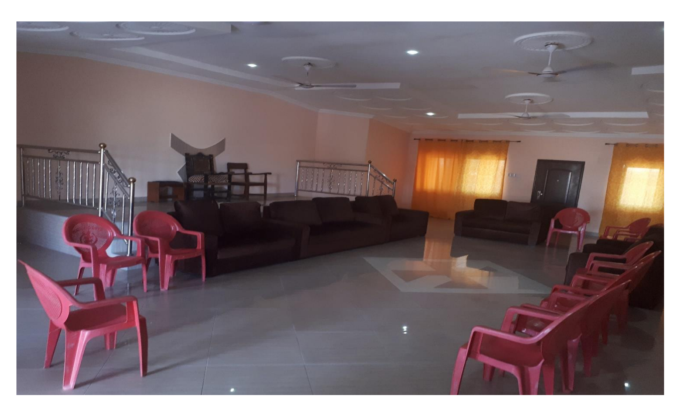
Inside look of the Chief's Palace