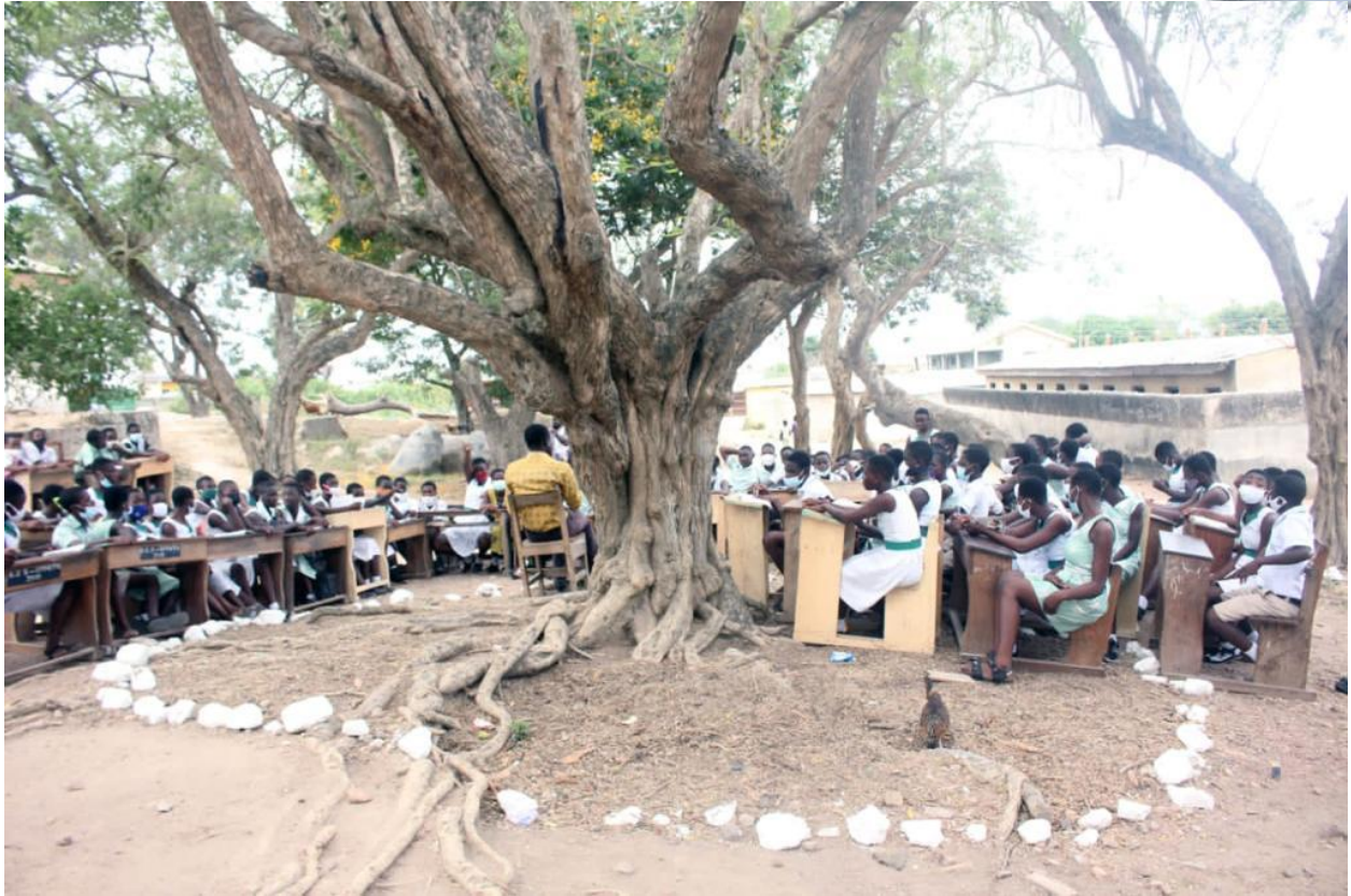
Pupils of Don Bosco school studying under Tree