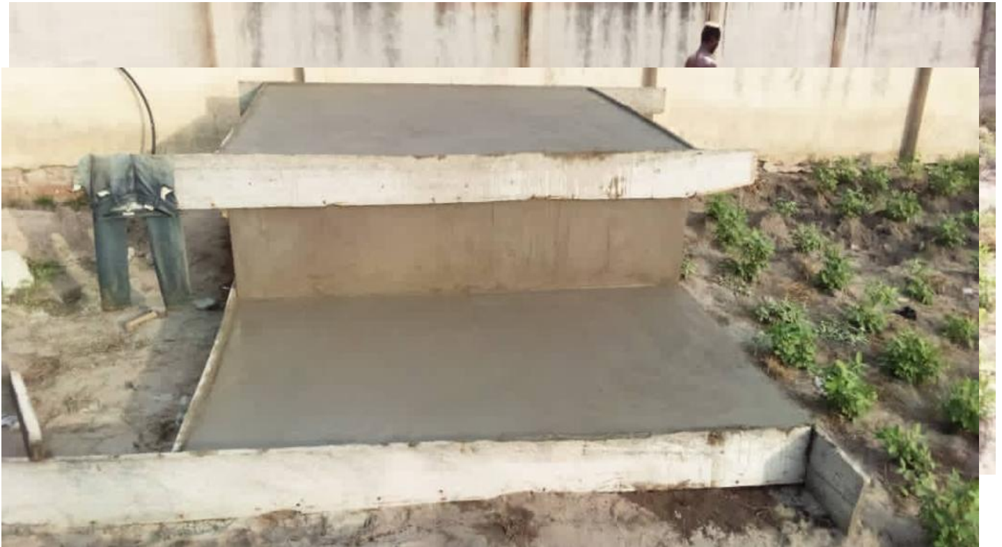
Construction of Platform for Sankor water storage

BHA has started the construction of a water storage facility for the people of Sankor community. The project is to help the people of Sankor to have access to portable drinking water.