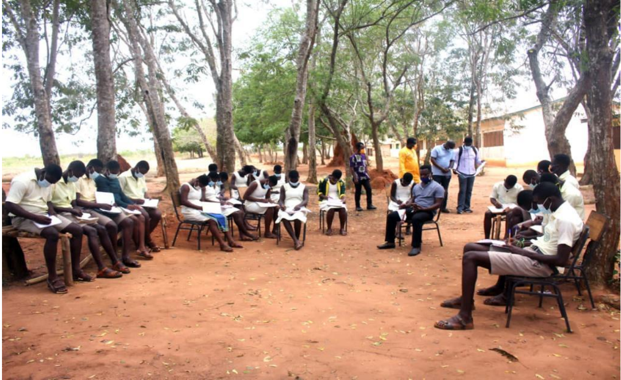
Some of the students having a General Science lessons under tree with no white marker board to write on, their teacher was dictating notes to them