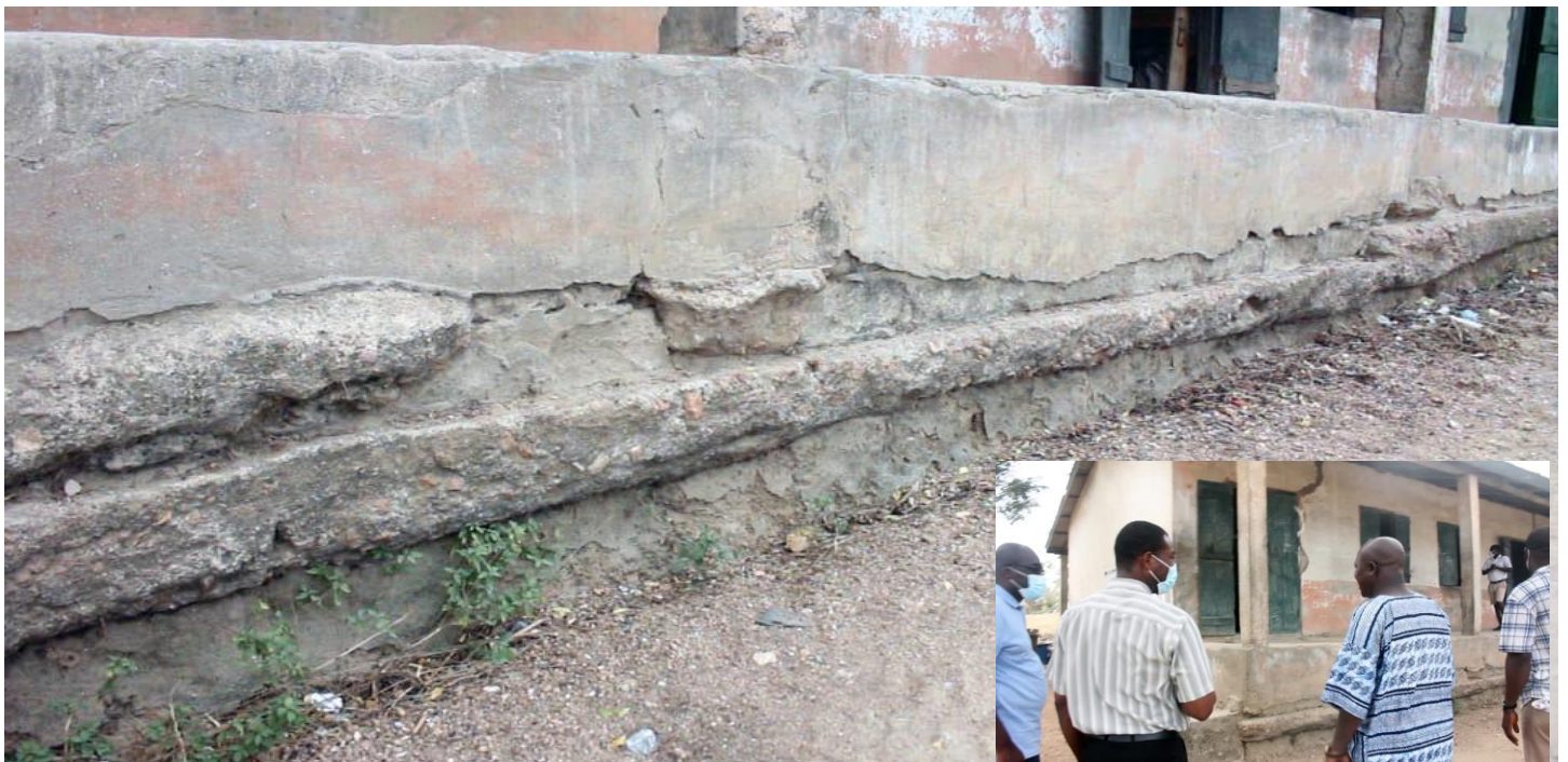
Depleted foundation of the school block