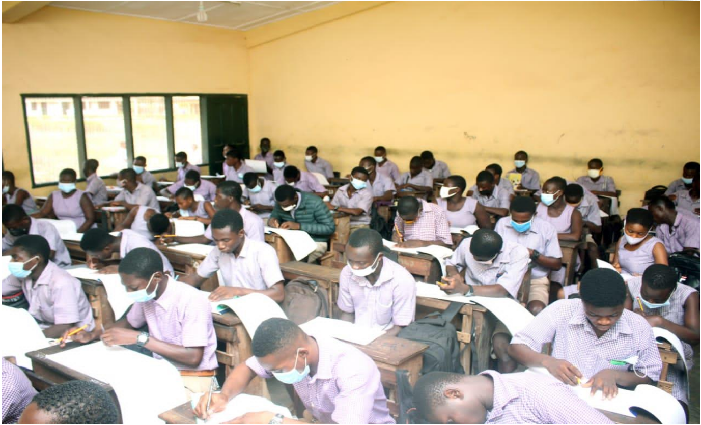
Students having a technical drawing lessons in a Class