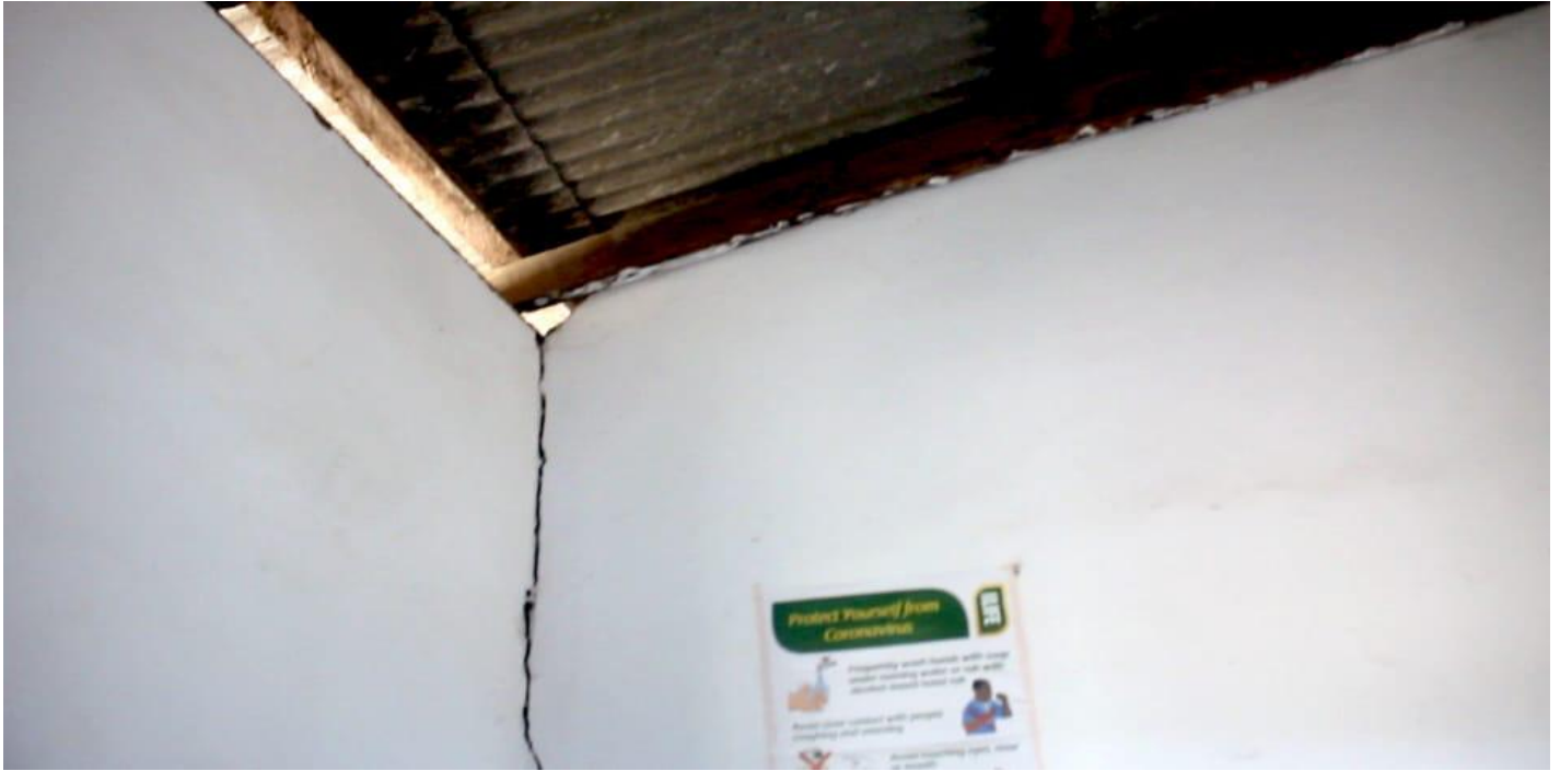
Cracked wall of the school classroom block