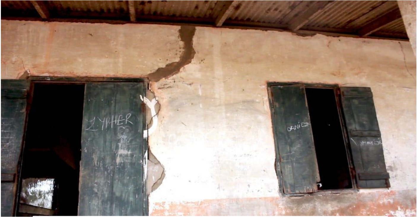
Cracked walls of the school building