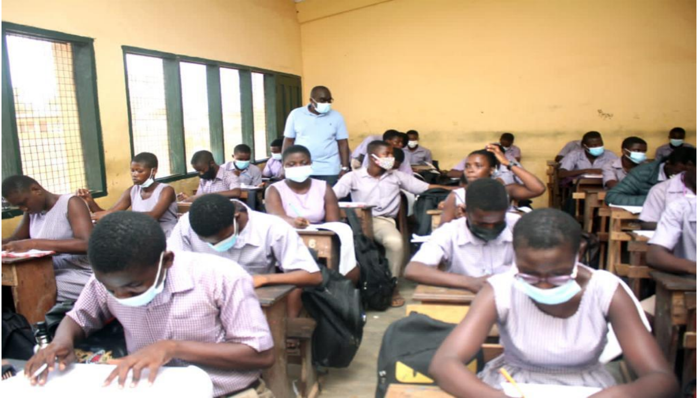
The Exec Dir of BHA observing Students having a technical drawing lessons in a Class