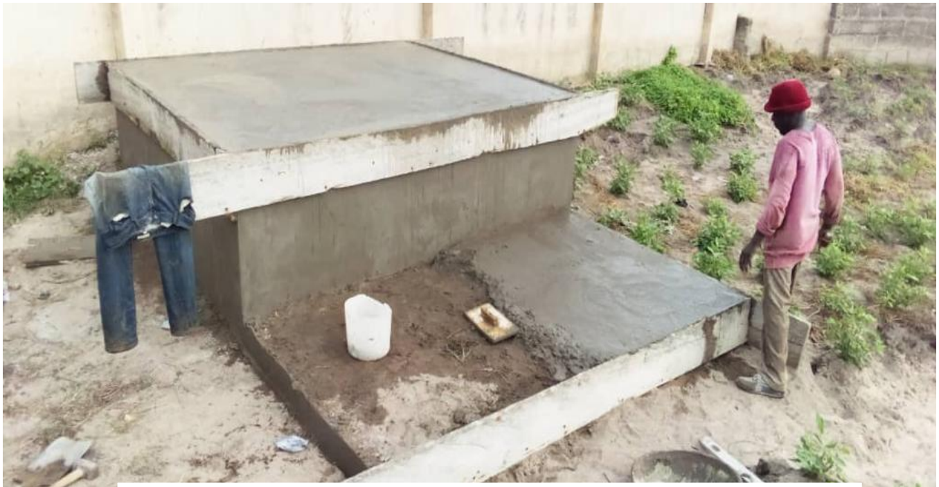
Construction of Platform for Sankor water storage