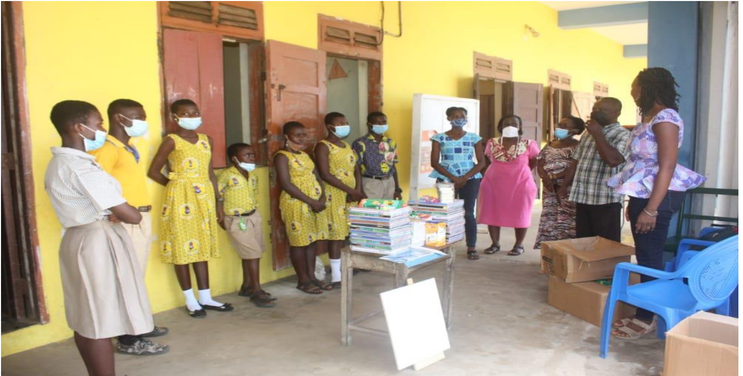
EDS Beneficiaries, teachers and the BHA team