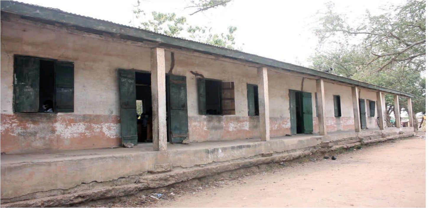
DON BOSCO B CATHOLIC JUNIOR HIGH SCHOOL BLOCK - OVER 70years old