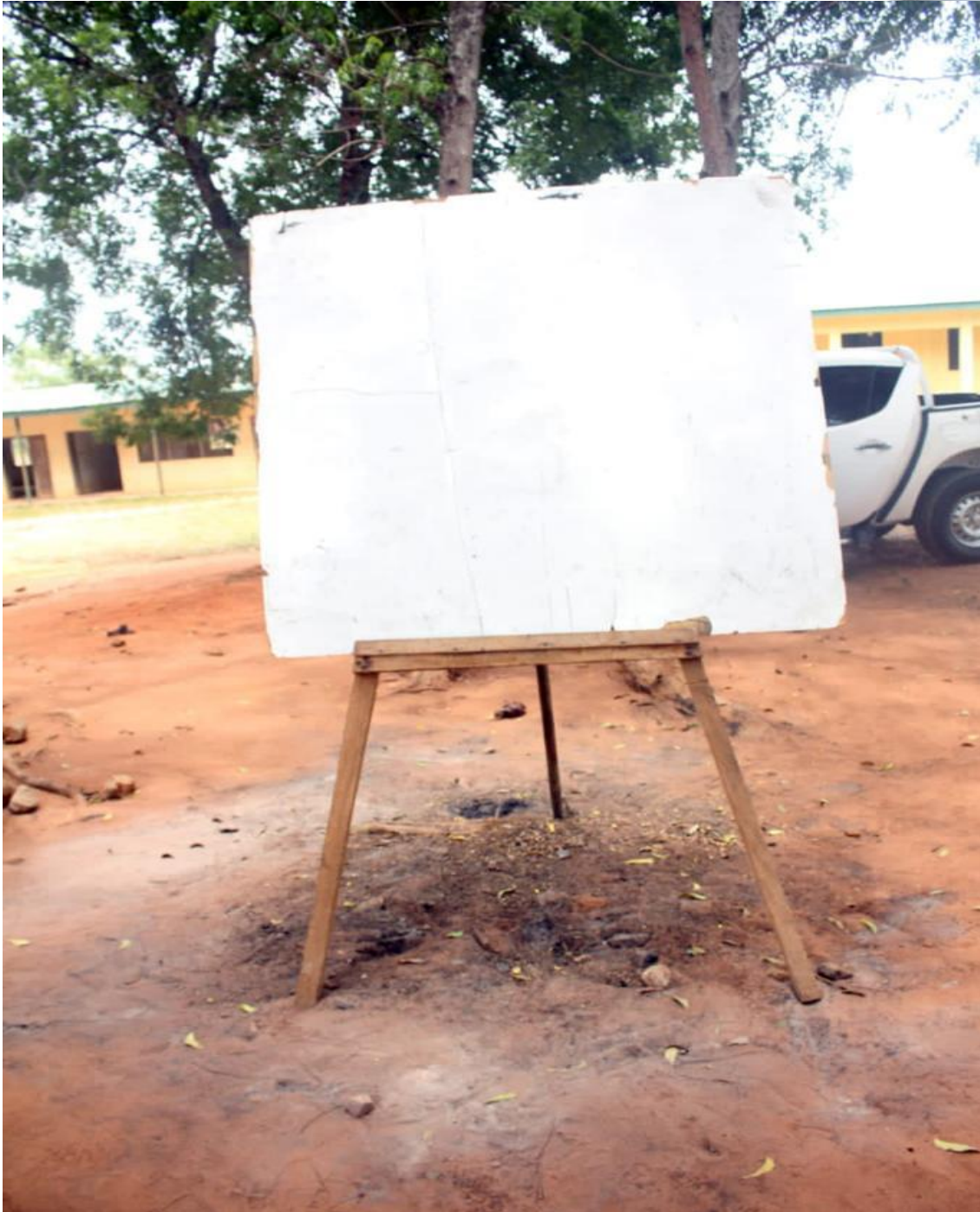
A picture of the Partially broken Movable White Marker Board in the school. Two lessons under the tree means one class will not have access to a marker board