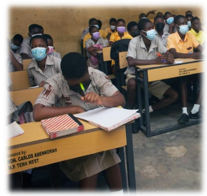
NOTEBOOKS BEING USED DURING A SOCIAL STUDIES LESSON

The computer screen projects unto the big projector screen, allowing the PC or information age generation of youth to capture and study in a more familiar and interactive manner.