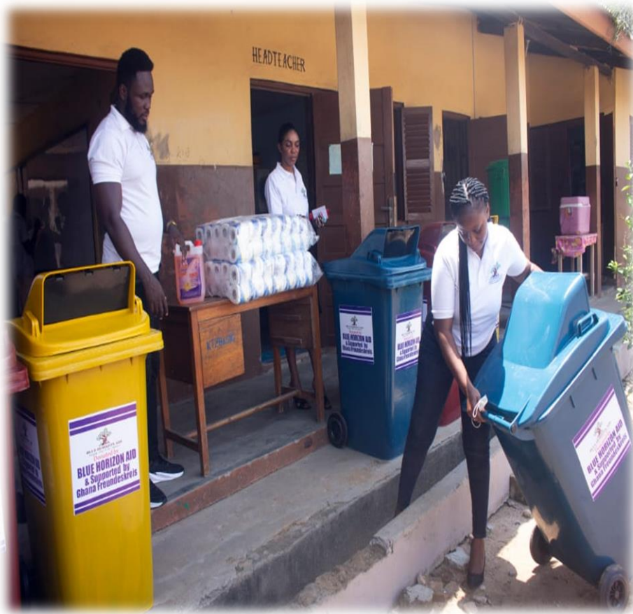
KOTOBABI NO.2 TMA JHS