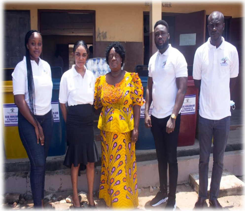
HEAD TEACHER WITH BHA TEAM