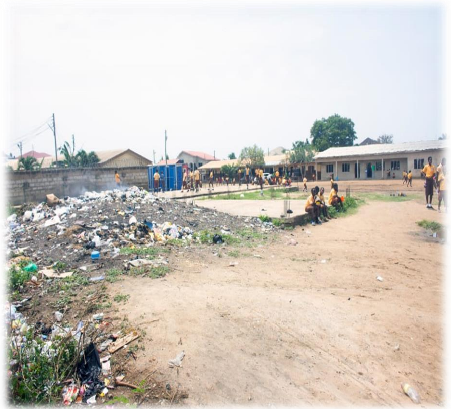
SCHOOL COMPOUND TURNED REFUSE DUMP

Teachers need to be motivated enough and well informed on sanitation to be able to extend morals of cleanliness to the pupils