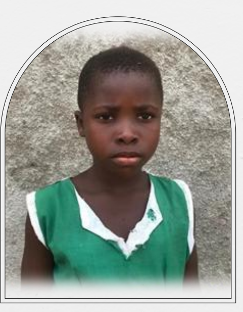
PRECIOUS BRONYA-CLASS 6 ST VINCENT CATHOLIC SCHOOL

BLUE HORIZON AIL Bringing Hope to the Hopeless