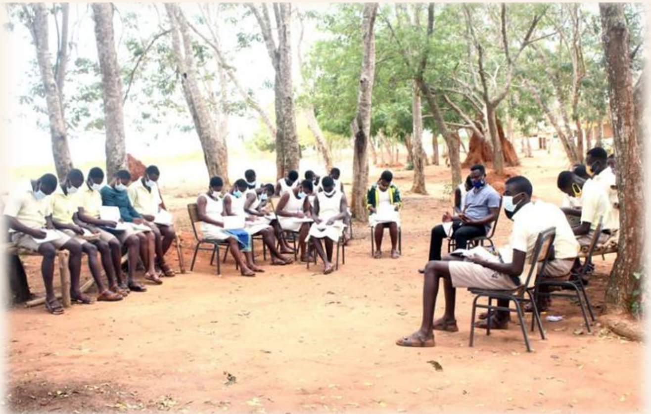
SENYA SHS STUDENTS STUDYING UNDER TREES

This all important project is to help Senya SHS sort out and relive the school of the enormous number of students without classrooms.