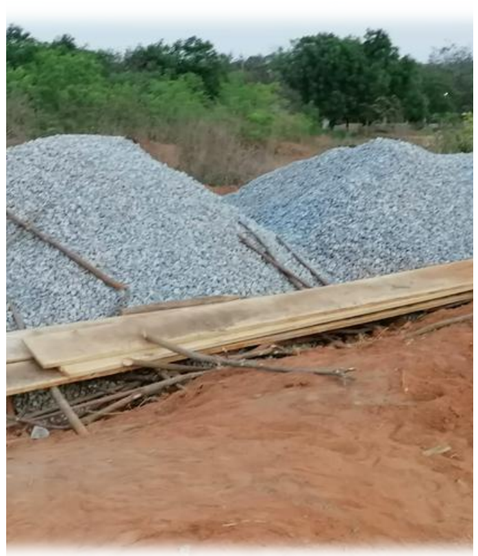
CHIPPINGS FOR CONSTRUCTION