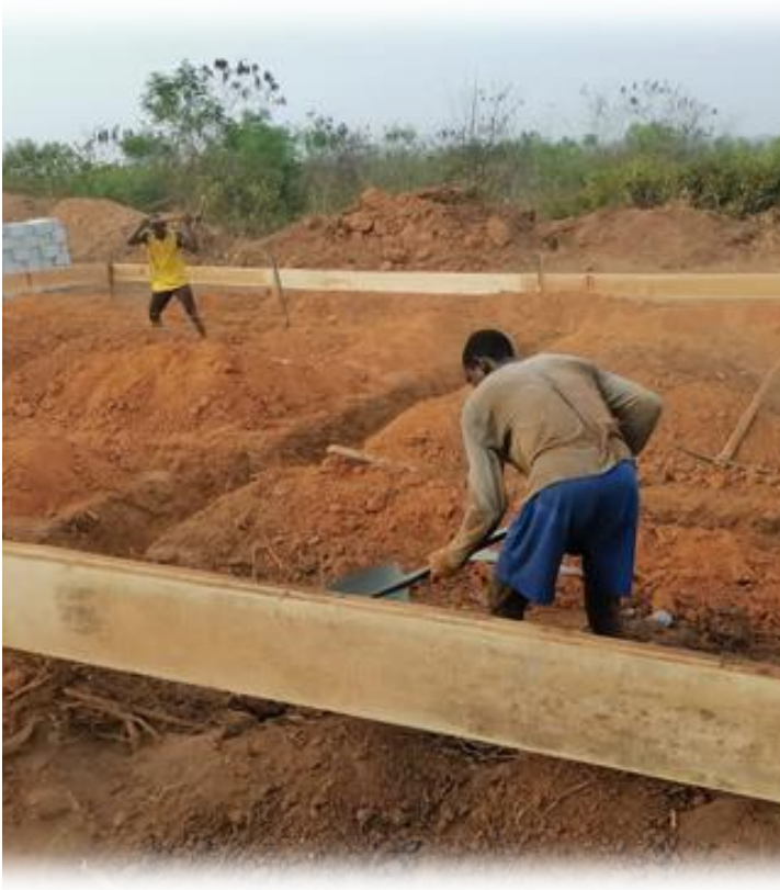
WORKERS SETTING OUT THE FOUNDATION