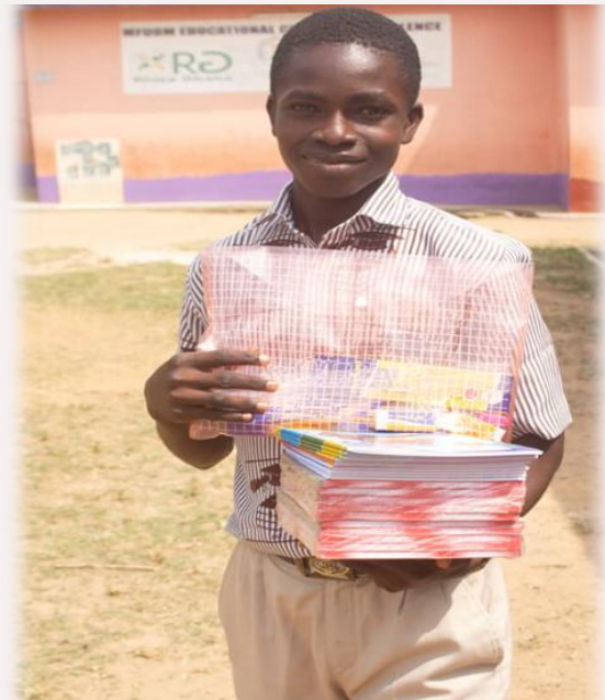
EDS BENEFICIARY OF MFUOM CENTRE OF EXCELLENCE SCHOOL

Good-to-Have's list includes 8 Items that propel the kids towards their learning success.