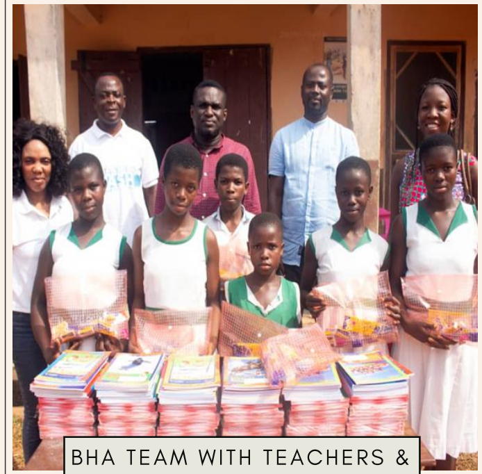
BHA TEAM WITH TEACHERS & BENEFICIARIES