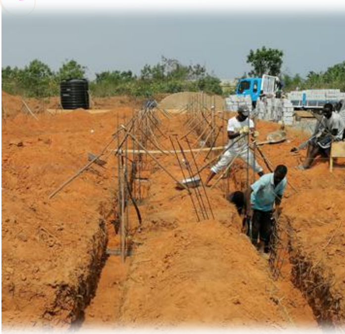
ERECTED IRON RODS FOR PILLARS