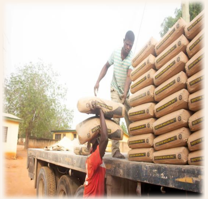
WORKERS CARRYING CEMENT OFF TRUCK