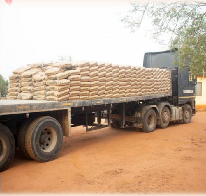
TRUCK CARRYING CEMENT TO BUILDING SITE