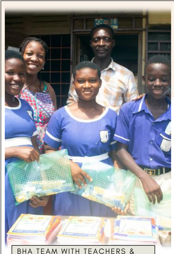
BHA TEAM WITH TEACHERS & BENEFICIARIES