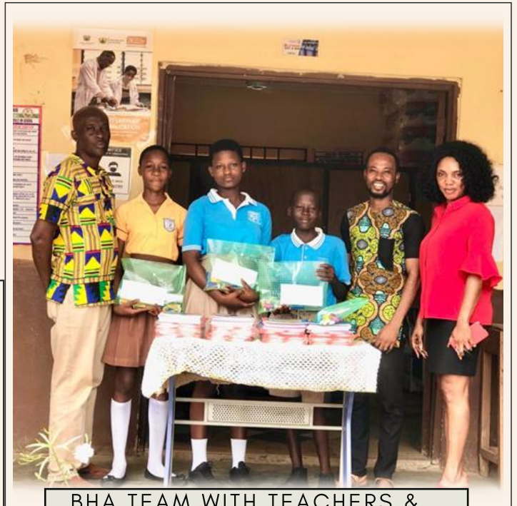
BHA TEAM WITH TEACHERS & BENEFICIARIES