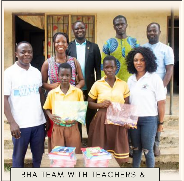
BHA TEAM WITH TEACHERS & BENEFICIARIES