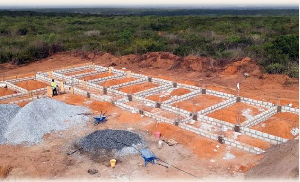
REVERSE ANGLE - AERIAL VIEW OF BUILDING UNDER CONSTRUCTION

When it comes to a building construction project, nothing happens overnight. This project is estimated to take about six months to complete. BHA will keep readers updated on the progress of the construction.