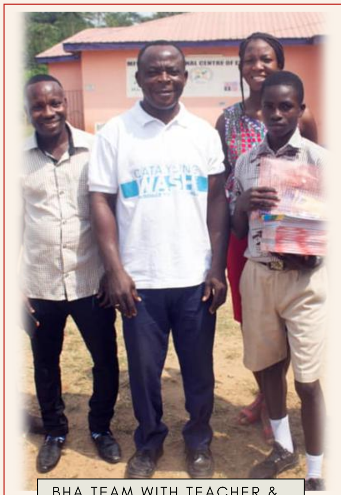
BHA TEAM WITH TEACHER & BENEFICIARY