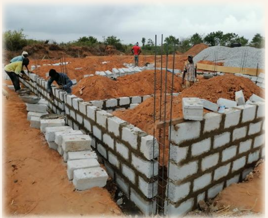
WORKERS LAYING THE FOUNDATION

flexible instructional space for effective teaching and learning. School buildings can have a profound impact on both teacher and student outcomes. With respect to teachers, school facilities affect teacher recruitment, retention, commitment, and effort and with respect to students, school facilities affect health, behaviour, engagement, learning, and growth in achievement.