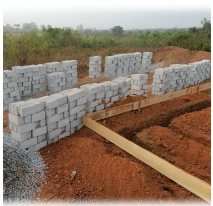
BLOCKS FOR CONSTRUCTION