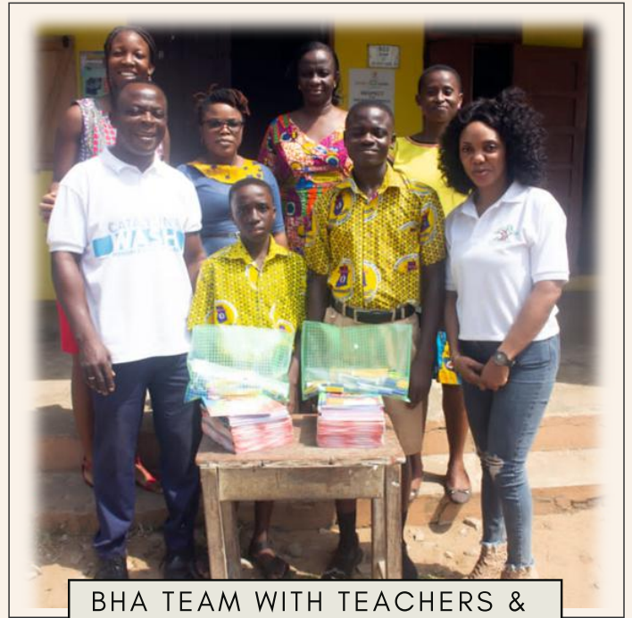
BHA TEAM WITH TEACHERS & BENEFICIARIES