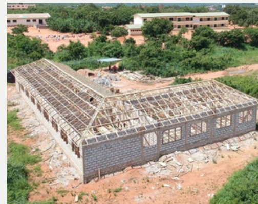
SENYA SHS SIX-UNIT CLASSROOM BLOCK CONSTRUCTION PHASES