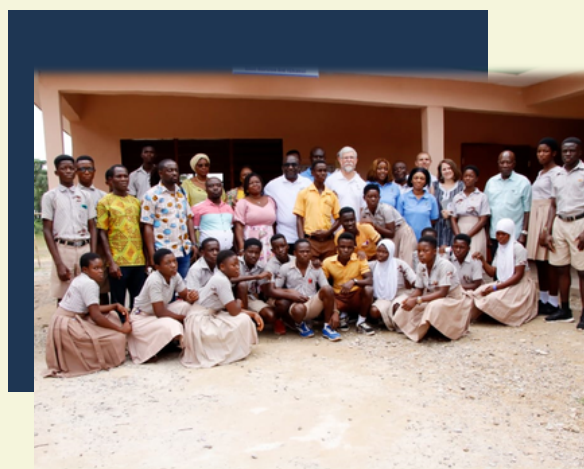
BHA TEAMS WITH SOME STUDENTS