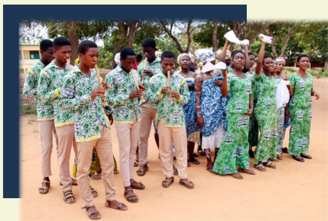
STUDENTS OF THE MUSIC DEPARTMENT PERFORMING AT THE CEREMONY