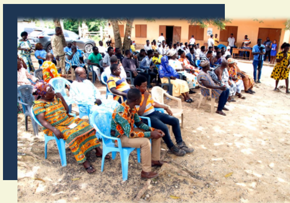
MEMBERS OF THE COMMUNITY