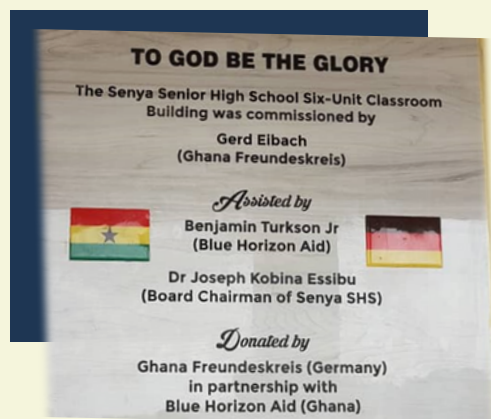
THE UNVEILED PLAQUE