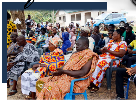
CHIEF, QUEEN & PEOPLE OF ABOMPUNISO