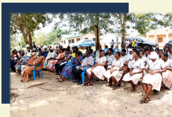
MEMBERS OF THE COMMUNITY WITH SOME STUDENTS