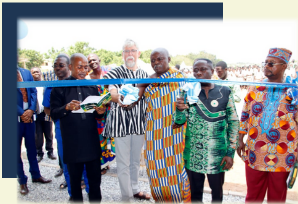
GFK CHAIRMAN, CHIEF OF SENYA CUTTING THE SOD TO COMMISSION THE PROJECT