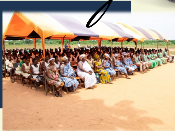
CHIEFS, DIGNITARIES & SENYA SHS STUDENTS