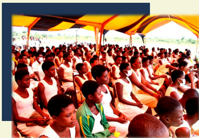
SOME STUDENTS AT THE CEREMONY