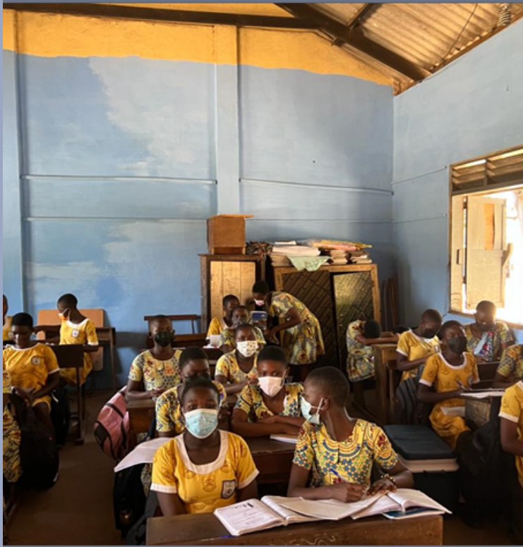
PUPILS IN CLASS