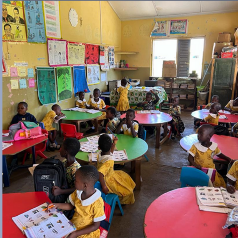
A KINDERGARTEN CLASS