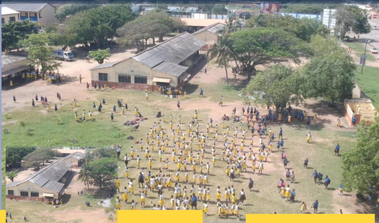
St Mary's R/C Basic School partners BHA