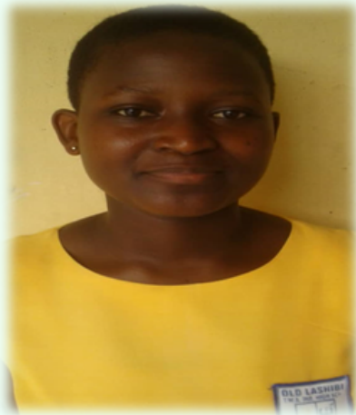
OLD LASHIBI TMA JHS - ACCRA ESINU BEDRAH HUSUNGBO JHS 3