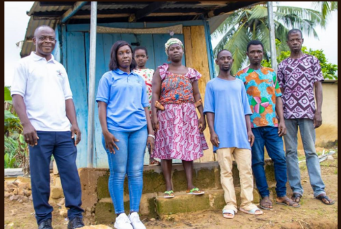
BHA Team with the madam at the shop premises where the ladies will learn the trade