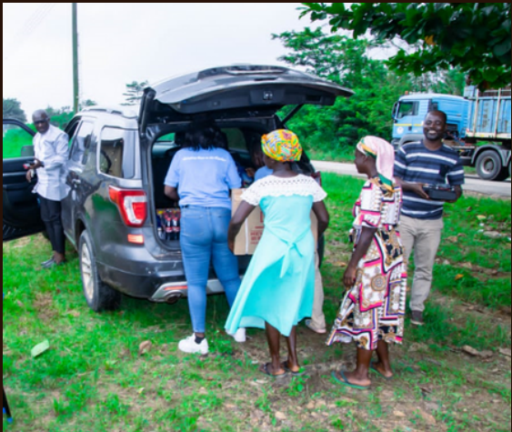
BHA Team offloading items from the car