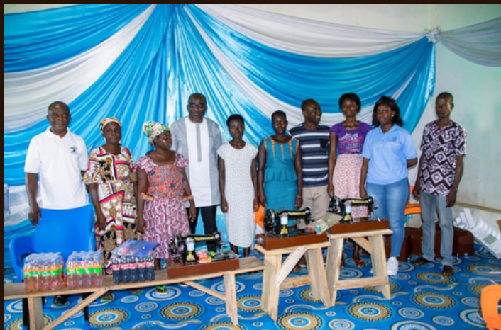
BHA with community leaders, the ladies and their madam