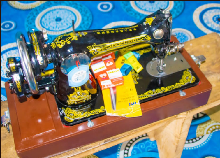
Display of one of the new sewing machines