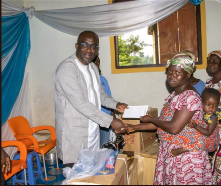
The madam receiving the asking price for the training