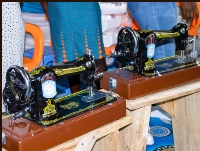
New sewing machines