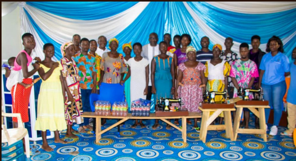
BHA Team with family, friends and loved ones who witnessed the ceremony