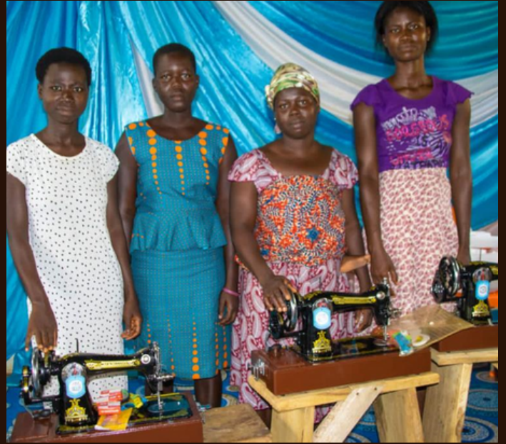
The ladies with their madam