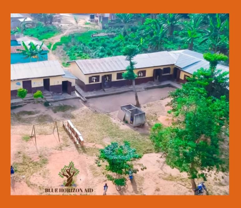
Dwenase Presby Primary school