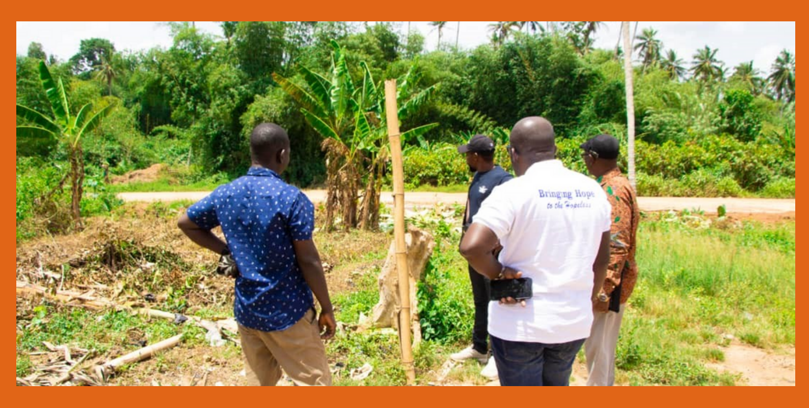
A picture of the main road that the children cross to fetch water

With meticulous planning and unwavering dedication, the engineers will embark on this ambitious endeavour. It is anticipated to be weeks of hardwork with rhythmic sounds of hammers and drills echoing through the village for the structure to take shape through digging and excavation. The project is expected to be commissioned in four weeks. More will follow in the coming weeks.