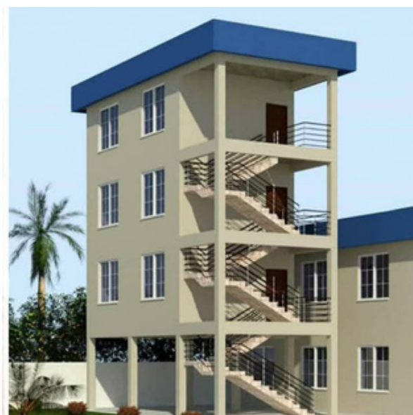
PROPOSED CHILDREN'S BLOCK

The support forms part of Blue Horizon Aid's commitment to promoting child development, education, and community welfare through strategic partnerships with local institutions and faith-based organizations. The proposed Sunday School block is expected to provide a safe and conducive environment for the spiritual growth, learning, and development of children within the church and surrounding community.