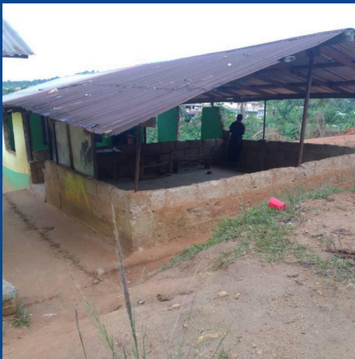
Here is a picture of the old, dilapidated classroom block."