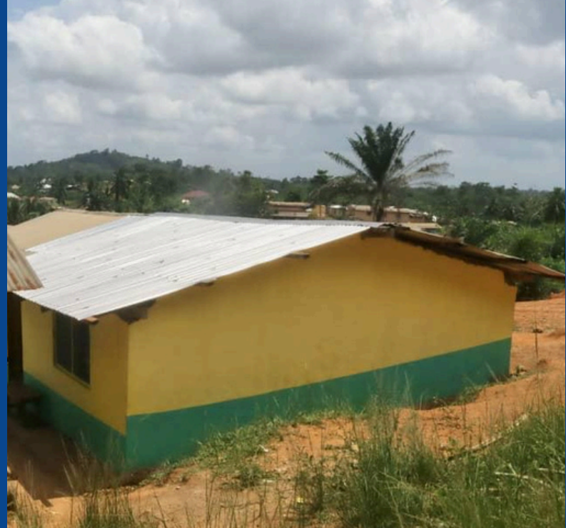
Here is a picture of the Newly constructed classroom block."